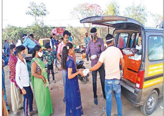
JAS Team masks and food Distribution in Mahabubabad, Medak Districts.