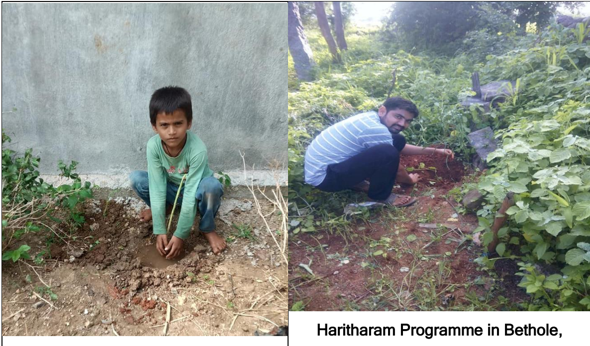
Haritharam Programme in Bethole,