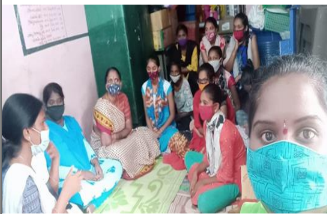
Covid Vaccine Awareness Program at Kamareddy District