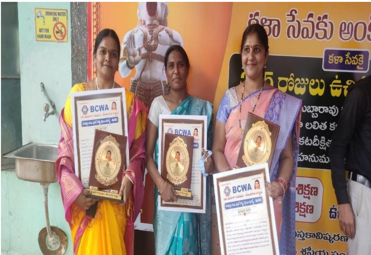
Jeevan Aadhar Society received by Savithribai Phule State Level Award in Ravindra Bharti, Hyderabad, Telangana State.