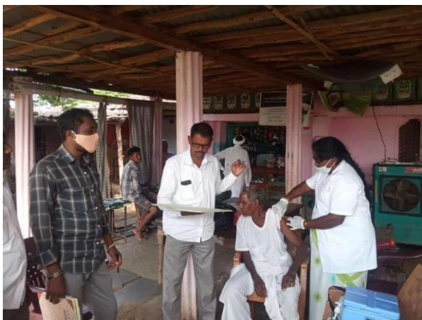
JAS Team vaccine Awareness in Choppadandi, Karimnagar district.