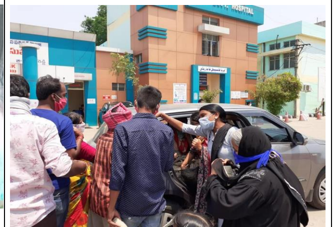
Grocery Items Distributions in Telangana Areas